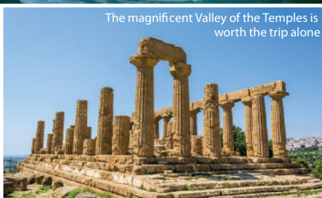
The magnificent Valley of the Temples is worth the trip alone