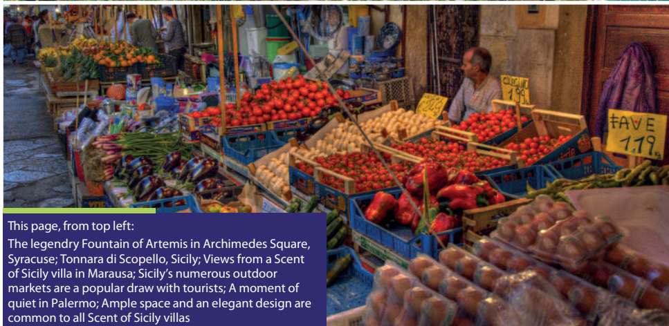
This page, from top left: The legendary Fountain of Artemis in Archimedes Square, Syracuse; Tonnara di Scopello, Sicily; Views from a Scent of Sicily villa in Marausa; Sicily's numerous outdoor markets are a popular draw with tourists; A moment of quiet in Palermo; Ample space and an elegant design are common to all Scent of Sicily villas